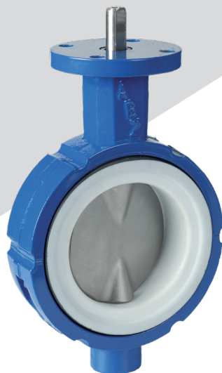
Fig. 719 Full lug style body